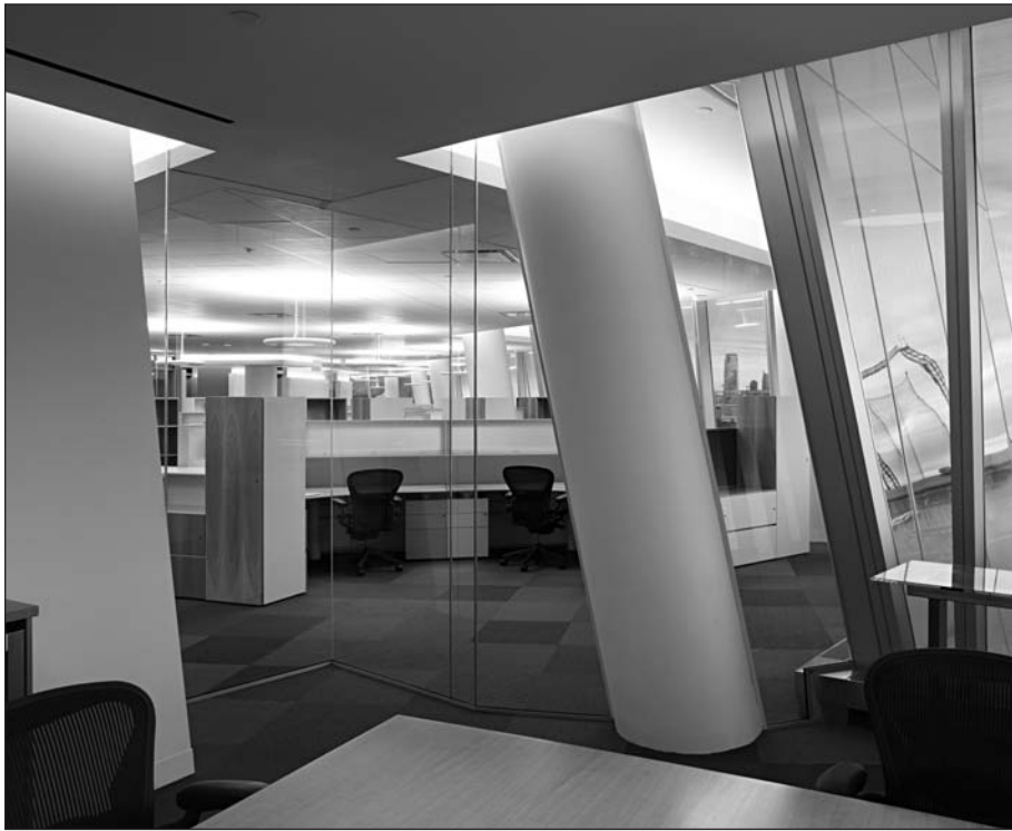
Fig. 3. The building frames both exterior and interior views.

The building thus forms its own viewfinder, framing images of the Hudson River, the Statue of Liberty, and the palimpsest of Chelsea and Midtown to the north and east. It is its own screen, reflecting and refracting those vistas and its own image for its inhabitants. And it is its own projector, glowing for cars zipping by and gallery-goers wandering through the streets of Chelsea (although denying them interior views above the ground floor).