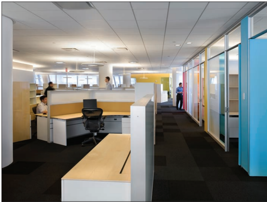
Fig. 4. The IAC building’s “Tropical Fruit” corporate interiors.