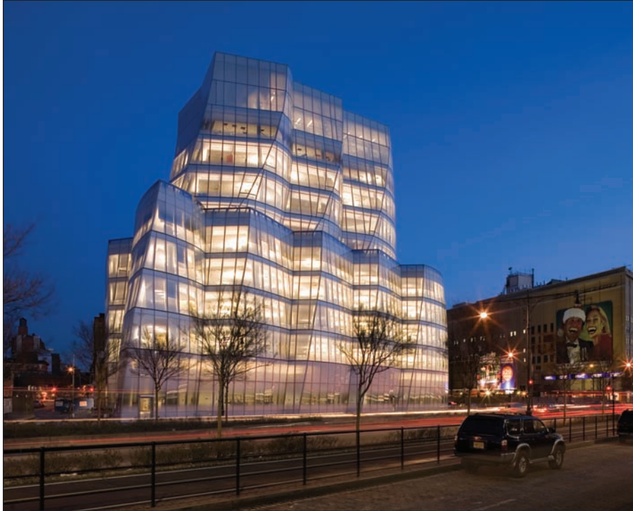
Fig. 1. IAC's glowing iceberg, or "glass schooner."

At some point during the design phase, Gehry showed Diller a model with a white material standing in for the windows, and Diller "got hung up on the building being all white, which, of course, you can't do with glass," the architect said (cited in Lieberman 2007). The solution was to use "frits," ceramic dots applied to the glass. The dot pattern is dense near the top and bottom of each panel and transparent at the middle—at occupants' eye level—thus framing their city views with a blurred edge. The fritting also serves to reflect light and reduce glare, thereby increasing the building's energy efficiency.