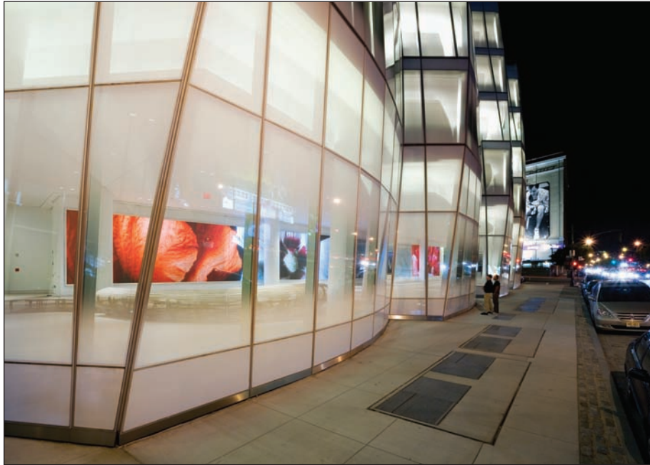
Fig. 2. The IAC building's media wall, visible through the West façade.

his Walt Disney Concert Hall in LA, seems to “erase” itself and downplays the engineering heroics that made it possible, the building required significant technical and structural innovation. We will return to this theme of “invisible” innovation.